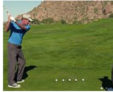
Classic golf mistakes amateurs make at the tee Classic Golf Mistakes