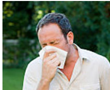
Signs of Severe Allergic Reactions LiveStrong