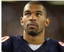
25 NFL Veterans Who Could Be Out of Work This Off Season Rant Sports