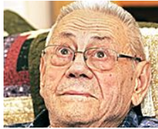
14 Social Security Benefits You Haven't Been Taking Newsmax