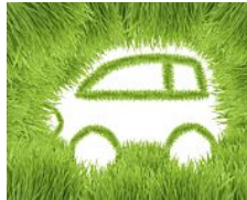
No Way: 25 Cars With MPG's as Good as Hybrids MPG-O-Matic