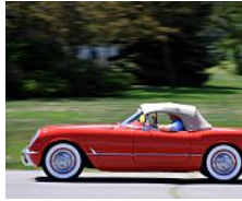
Check Out Jerry Seinfeld's Insanely Impressive Car Collection! Wall St. Cheat Sheet